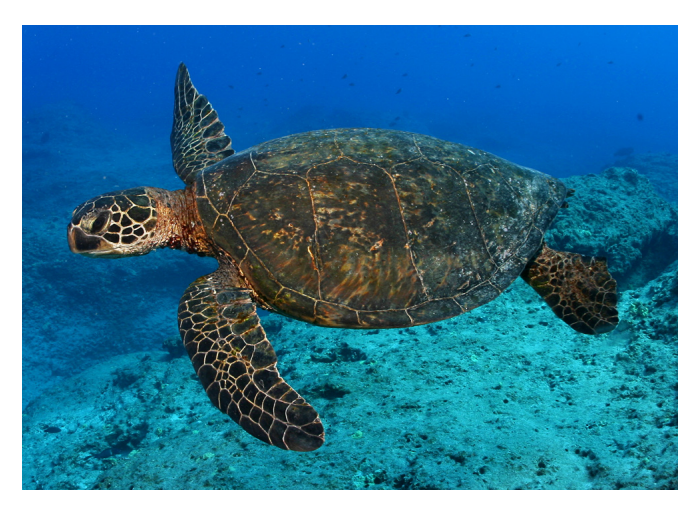
Green sea turtle.

vation of the species within their monument. This sacrifice (of the fishing revenues and livelihoods of eight fishermen, some indigenous Hawaiians) provides at least a minimum valuation of the bequest value held collectively by the broader Hawaiian population.