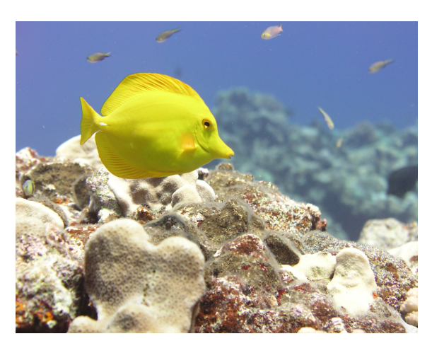
Underwater habitat of Maug Island.

Note that use values include extractive activities. Fisheries, ocean mining, and bio-prospecting would also fall into this category. If ocean mining becomes more economically feasible in the future, the remote location of the MTMNM and the U.S. federal regulatory agencies would likely deter potential mining operations. However, both mining and pharmaceutical "options" have some value. Bio-prospect-