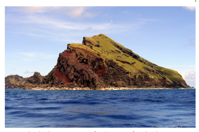
Maug Island.

Secondary Data Analysis There was no primary data collection for this project. Secondary data analysis was conducted on CNMI government documents and recent economic reports. In the case of economic multipliers, some adjustments were made to what were considered overly optimistic or poorly constructed measures of the multiplier effect.