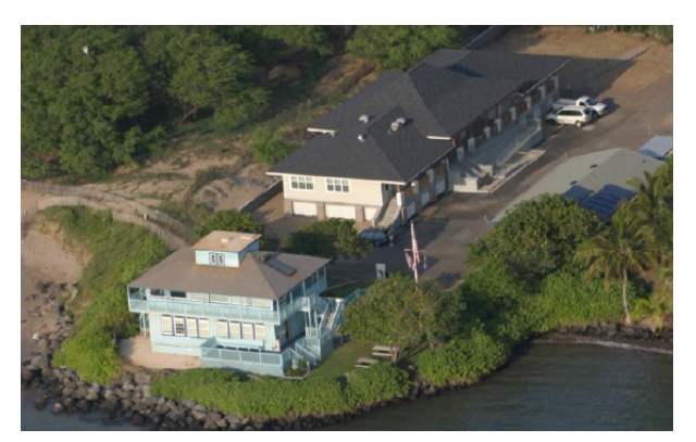
Congress appropriated $1,786,000 in the fiscal year 2008 for the Hawaiian Islands Humpback Whale National Marine Sanctuary Kihei Facilities Project in Maui, Hawaii.

One good example of this sort of study was conducted by Angelou Economics, as they measured the economic impact of a major film and music festival in Austin, Texas. With the luxury of actually measuring the participation at the events, the firm found direct expenditures of about $12 million dollars and a total impact on the economy of about $18 million dollars.