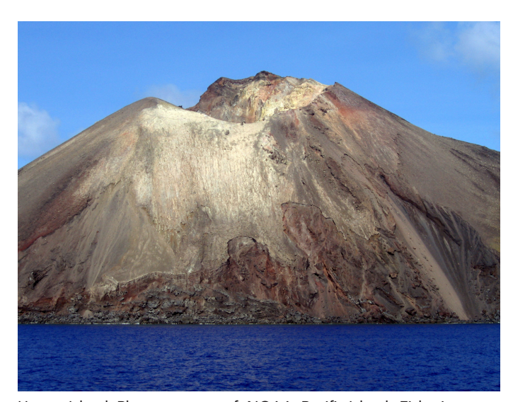
Uracus Island.

The 1999 Economic Impact Study recommended that the CNMI government should implement the provisions of the Magnuson-Stevens Act which allow Pacific Insular Area Fishing Agreements (PIAFAs). These would charge fees for the establishment of a Western Pacific Sustainable Fisheries Fund to be used for managing the program and for conservation and management objectives in the western Pacific. The figure of $500,000 was recommended by the authors of the 1999 study.