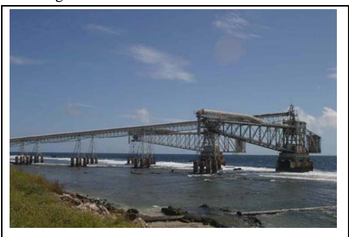
Herb Wade 2004

Figure 1.4 – Phosphate Cantilevers for Ship Loading