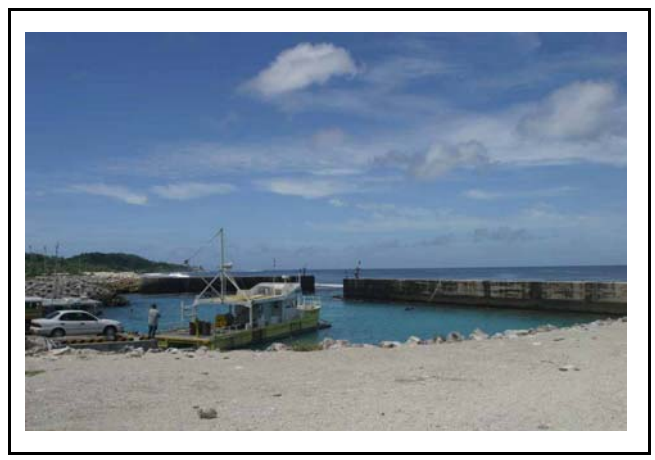
Herb Wade 2004

Figure 1.6 – The Japanese funded harbour at Anibare