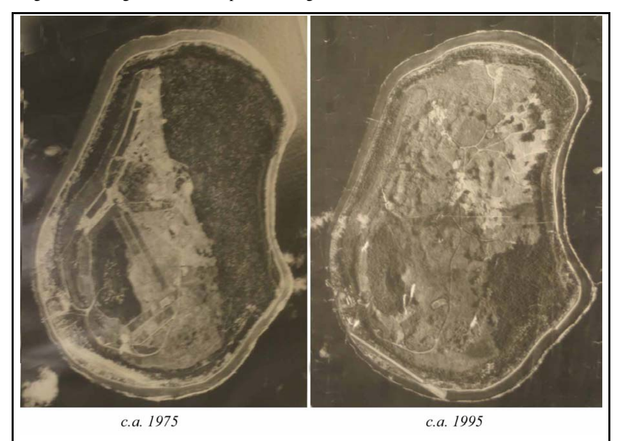
Figure 1.7 - Progression of Phosphate mining from about 1975 to 1995

Nauru has no personnel with experience in renewable energy development and few with any training at all in either renewable energy or energy efficiency technologies.